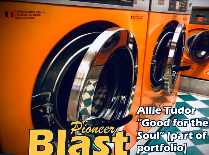
Allie Tudor "Good for the Soul" (part of portfolio)